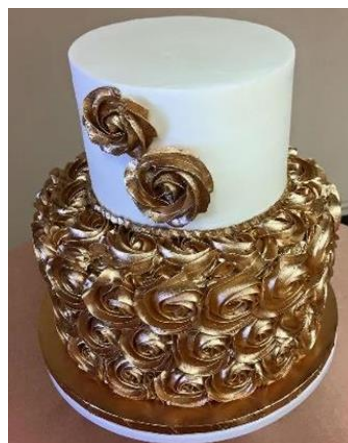
(Additional Charge for Metallic Airbrush)