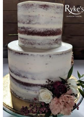
(Flowers Not Included)