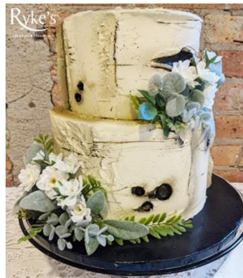
(Flowers Not Included)