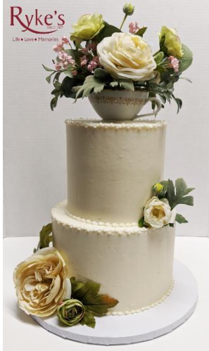
(Flowers Not Included)