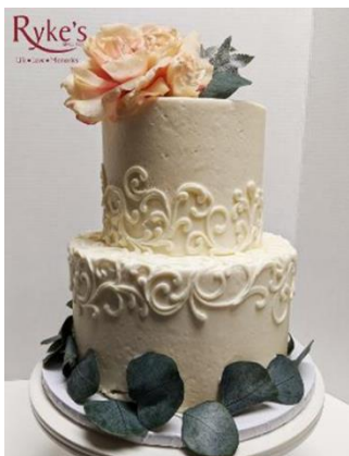
(Flowers Not Included)