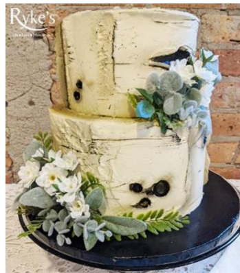
(Flowers Not Included)