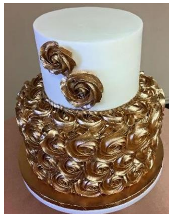
(Additional Charge for Metallic Airbrushed Buttercream)